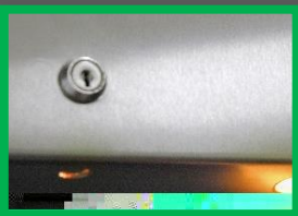
Door key lock