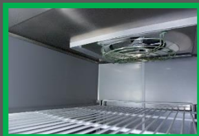
Air forced cooling