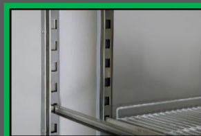
Full rounded corners, pressed bottoms and removable stainless steel rack holder