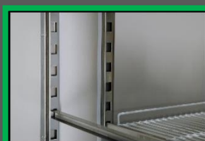
Full rounded corners, pressed bottoms and removable stainless steel rack holder