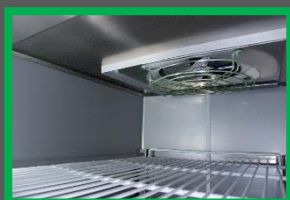
Air forced cooling